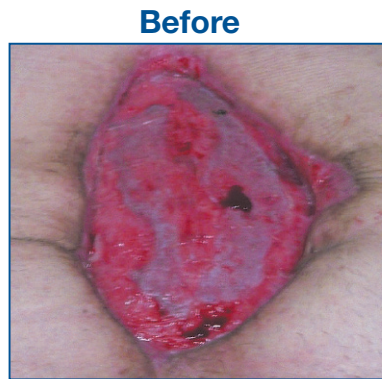
Day 9 of Invia® Wound Therapy