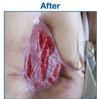
Day 84, treatment goal of improved granulation tissue achieved, transitioned to hydrogel dressing