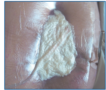
Wound with Invia® Wound Therapy in place