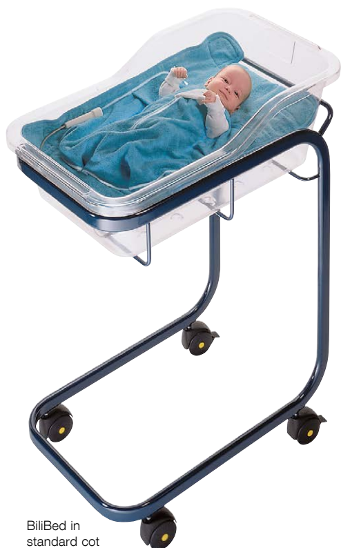
BiliBed in standard cot